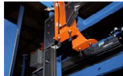
Label Mount centered on a Z-20 Cross Strapper

plying to a package that could vary in height the applicator had to be beefed up in case of any crashes. This made the applicator expensive in not only initial cost, but also in maintenance. ASI's engineers realized that the Cross Strap