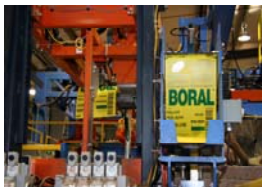
ASI's Label Applicator at the Cross Strapper on a Dehacker

For several years we have tried to apply the label directly onto the package and hold it in place allowing the Cross Strapper to strap the label onto the package. This resulted in a label that wasn't always positioned correctly. Also since we were directly ap-